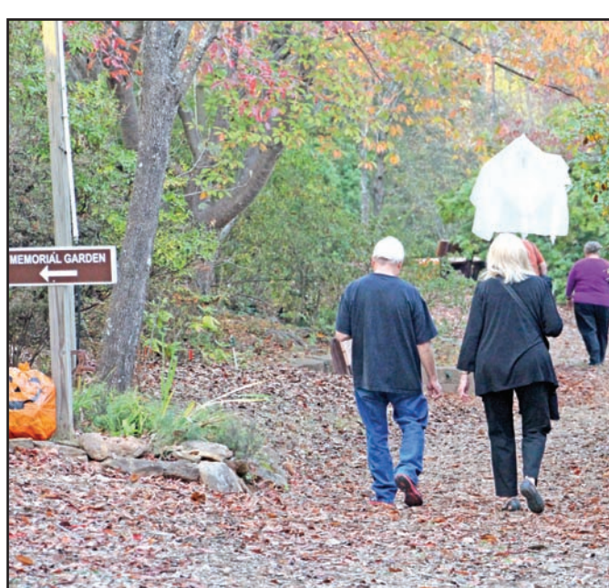
The Hamilton Gardens during the Oct. 29, 2016, Halloween event known as the "Spooktacular Evening in the Gardens."